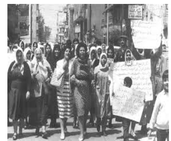
Image 1. Families marching during the civil war.

A detailed timeline of events and activities is presented in Annex I of this case study.